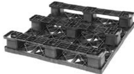
> 3 runners (3R)