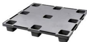
> closed deck (CD)