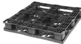
> 6 runners (6R)