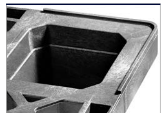
Optional without safety rim