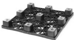
> 9 feet (9F)