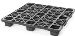
> open deck (OD)